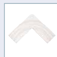
Swept Bend Guide