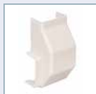
Cross Over T