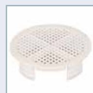
70mm Vent Plug