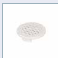
20mm Vent Plug